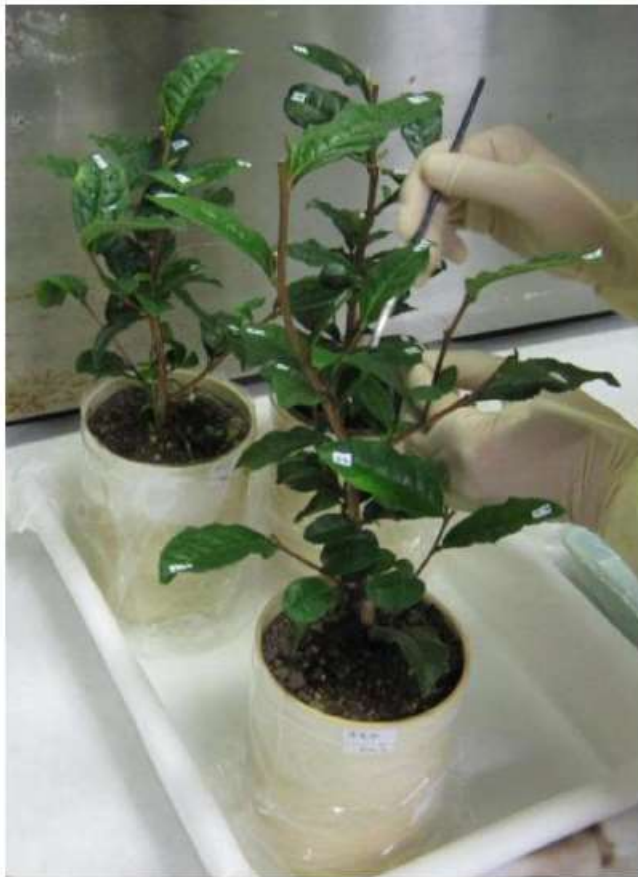
Fig. 1. Foliar application of ^{137}\text{CsCl} solution ( 1.85 \text{ KBq mL}^{-1} ) with a paintbrush.