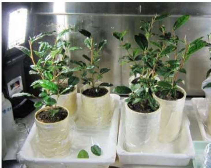
Fig. 2. Tea plants cultured in the draft chamber after foliar application.