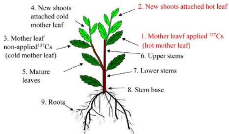
Fig. 3. Separation into nine parts of tea plants at harvest after foliar treatment.