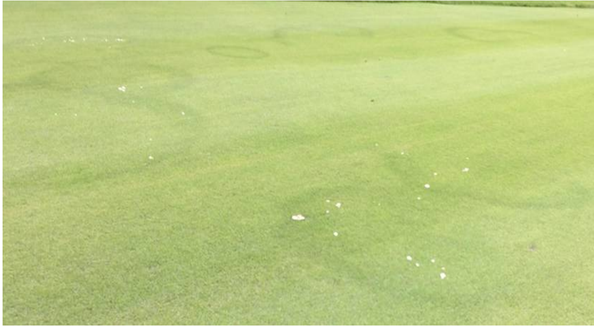
Figure 1. Fairy rings appearing on golf course grass.

(FCs) after the title of the article in Nature that covered our study [8]. Subsequent studies have demonstrated that FCs endogenously exist in all the plants tested, including edible parts of three major cereal crops, rice, wheat, and corn [7]; thus, people have eaten FCs for a long time. Furthermore, FCs increased the yields of rice, wheat, and other crops under field and greenhouse conditions [5,9,10]. These results suggest that FCs are a new family of plant hormones [11,12].