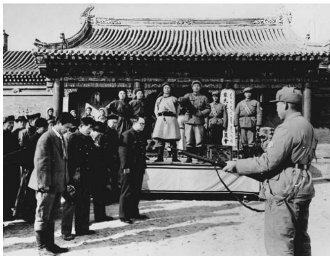
figure 16, a famous propaganda film: “where is the motherland of Mongols?”

In the Sijiayao People's Commune of Tumed League, 32 people were killed. In the Tug People's Commune of Ushin Banner, Ordos, 54 (or 69 according to other statis-