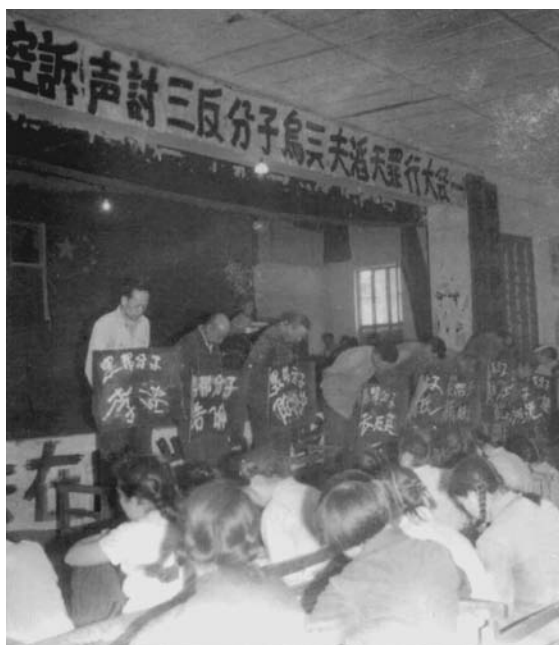
figure 7, Many Mongols and "Chinese betrayers" were mistreated by the Chinese

In the Chahar Right Wing Rear Banner of Ulaanchab League, about 200 Mongolians were murdered. In the Sayihantala Production Brigade of the Ulaanhada People's Commune, the "Thoughts of Mao Zedong Propaganda Campaign Team of the PLA" and the "Thoughts of Mao Zedong Propaganda Cam-