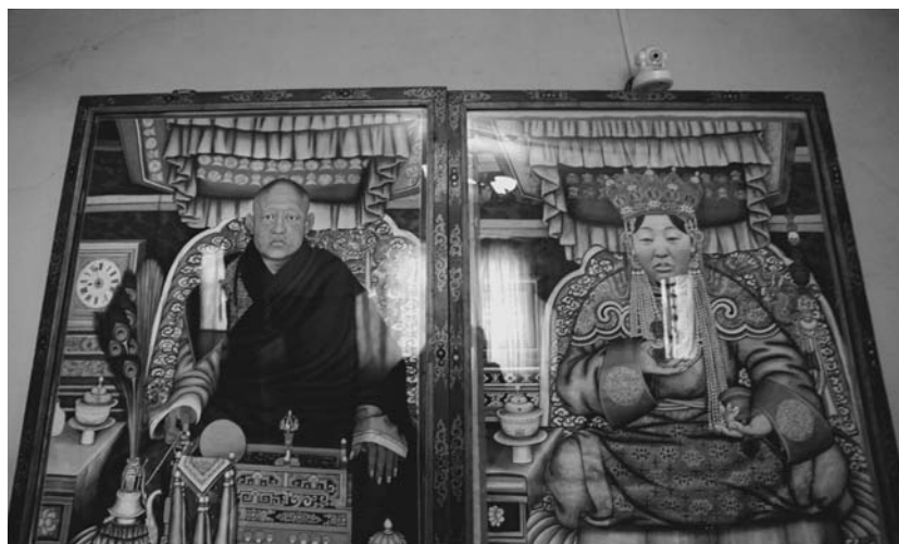
figure 3, Jebtsundamba Khutuktu and his queen

In the 20 th century, Sun Yat-Sen also propounded a slogan similar to that of the Jindandao in his political movement. He established the Republic of China in 1912, appealing to the Chinese people to “expel Mongolians and restore the glory of China”. He followed the example of Zhu Yuanzhang, the first emperor of the Ming dynasty, and established a new capital in Nanjing. Around the same time, the Mongolians also decided to break away from Manchurian rule. The eighth reincarnation of the line of the Jebtsundamba Khutuktu (Holy Venerable Lord), who resided in the Great Steppe of Mongolia, appealed to fellow Mongolians to achieve unity. He talked to various tribes, spreading the message, “Let us become one people so that we will no longer be abused by the Chinese”. Jebtsundamba (figure 3) prepared and distributed multiple