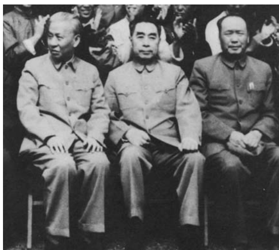
figure 4, Ulaanhu (right) and Zhou Enlai, Liu Shaoqi

It should be understood that the CPC used the history of the IMPRP as the justification for the massacre of Mongolians during the Cultural Revolution. Eighteen years after the foundation of the People’s Republic of China after World War II, the CPC made the Mongolian people pay for what they had done when Manchuria was ruled by the Japanese army. In the process of accusation, they blamed Mongolians not only for their aspirations for ethnic self-determination but also for their association with Japan. The Mongolian elites and intellectuals, who pursued ethnic autonomy, had grown up under Japanese rule, learning about Japanese modernisation. In fact, the CPC’s involvement with the resistance against Japanese aggression had been very limited. However, they had significant grievances against the Mongolians, who had had special relations with Japan in their historic process to pursue independence from China before the end of World War II.