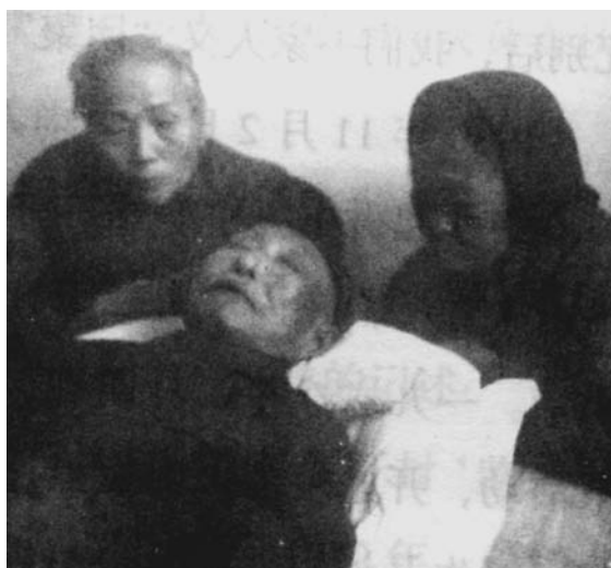
figure 8, Hafunga was killed by Chinese in November, 1970.

Li Guodao was a Chinese member of the "Geological Expedition to Inner Mongolia", which was headquartered in Huhhot City. He instigated a propaganda campaign to "get rid of all Mongolians". Violence against the Mongolian staff escalated. There