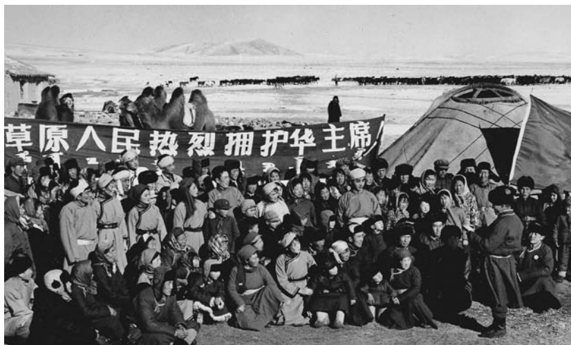
figure 1, Inner Mongolia under China's rule

edly committed against Mongolian women in those days. (Yang 2013a: 32-37; 2013b: 95-103) Probably it was the first time in history for women in nomad communities in northern and central Asia to experience such outrageous sexual humiliation.