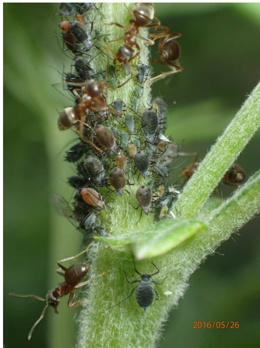
Fig. 1. Color polymorphism in M. yomogicola and attending ant, L. japonicus . Large black aphids and small green ones are green morphs, whereas large and small orange and brown ones are red morphs.

Here, we investigated a color polymorphic mugwort aphid ( Macrosiphoniella yomogicola ; Fig. 1) that is attended by ants. Because ants attend this species, M. yomogicola should not experience strong predator-mediated selection. Thus, the coexistence of the two color morphs in this species cannot be explained by frequency-dependent predation. We should also note that the two color morphs cohabit sympatrically on a mugwort shoot (Fig. 1). This means that the balancing selection of two opposing selection pressures is not likely to explain this polymorphism, because the environmental heterogeneity that is required to maintain this type of polymorphism is unlikely to take place. Polymorphism by overdominance is also unlikely in this case, because the two color morphs reproduce parthenogenetically during the observed spring-summer seasons. Therefore, the former three hypotheses are not likely to explain the color polymorphism in M. yomogicola . Thus, we hypothesized that the color polymorphism in M. yomogicola is maintained by the attending ants because they prefer aphid colonies with a specific ratio of the two morphs. To test this hypothesis, we measured the preference of the ants to the aphid colonies with different proportions of the two morphs. We initially evaluated the effects of attending ants on the survival of the aphid colonies by experimental removal of the ants. We show that the attending ants are necessary for the persistence of the colony. We then